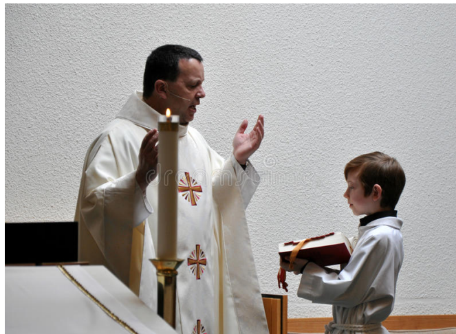
The priest and altar server at the collect

AT THE END OF THE GLORIA , the priest prays the collect . One altar server brings the missal to the priest on the altar and stands in front of him. The priest will then open the missal and pray the collect. The altar server closes the missal and returns it to its stand. Everyone sits down while the lector proceeds to the altar to proclaim the Word of the Lord.