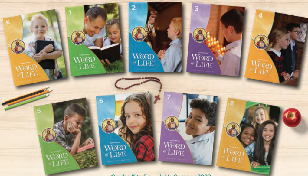
Grades K to 5 available Summer 2022 Grades 6 to 8 available Summer 2023

Through four golden catechetical threads, Word of Life provides a vision with answers.